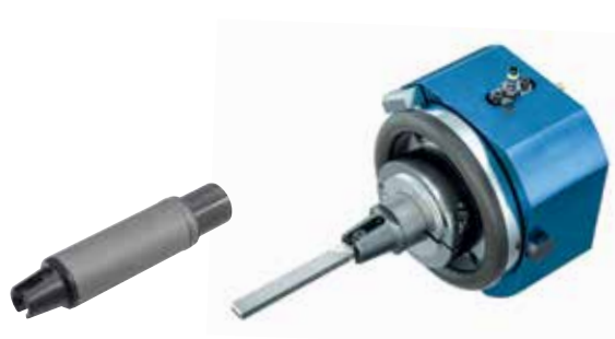
Radial one axis compensation with position sensor