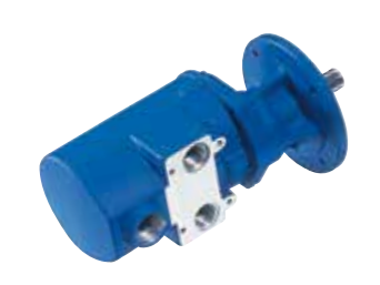
Example: gear drive