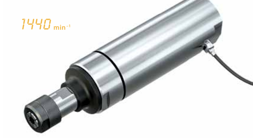
With speed sensors for process monitoring