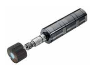
| Example: quick change chuck