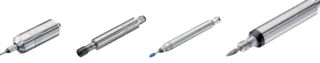
For deburring, grinding and polishing