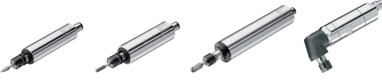
For installation in transfer lines, machine tools and robot cells