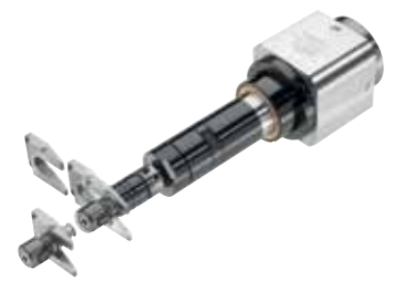
With quick change chuck