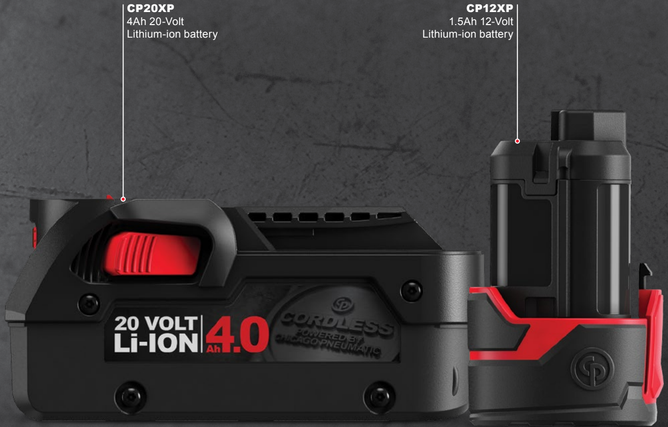
CP20XP 4Ah 20-Volt Lithium-ion battery