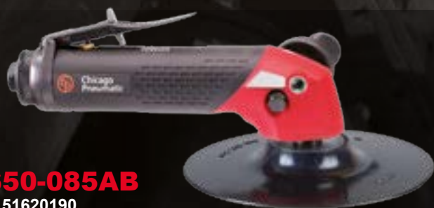
CP3650-085AB Art nr 6151620190