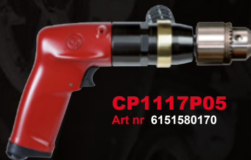
CP1117P05 Art nr 6151580170