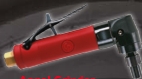
Angel Grinder CP3019-12AC