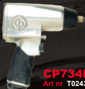
CP734H 1/2" Art nr T024351