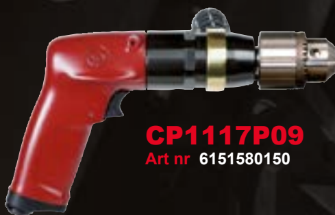
CP1117P09 Art nr 6151580150