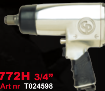
CP772H 3/4" Art nr T024598