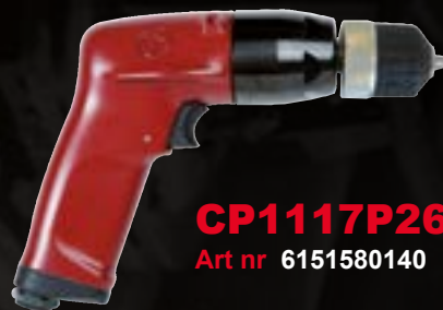
CP1117P26 Art nr 6151580140