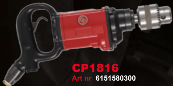
CP1816 Art nr 6151580300