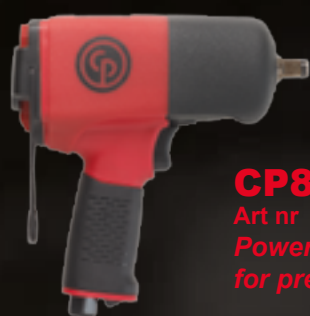
CP8252-R 1/2" Art nr 6151590250

Powerful and easy to control for precise assembly jobs