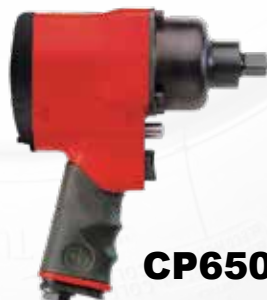
CP6500-RSR T025216 3 600 ₺

The best heavy-duty 1/2" for the toughest jobs!