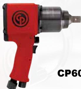
CP6060-P15H 6151590090 16 000 ₺