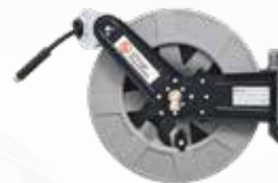
HR 9110 & HR 9113