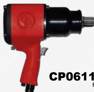
CP0611P-RS 6151590050 28 500 ₺