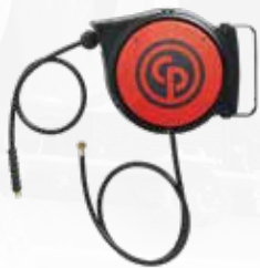
HR8108 & HR8208