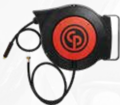
HR 8110 & HR 8210