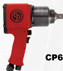
CP6070-P15H 6151590110 16 000 ₺

Best 1" lightweight impact for Industrial Maintenance and Production applications