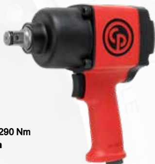
CP6773 1" 6151590410