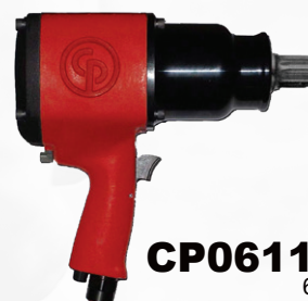
CP0611P-RS 6151590050 30,000,-