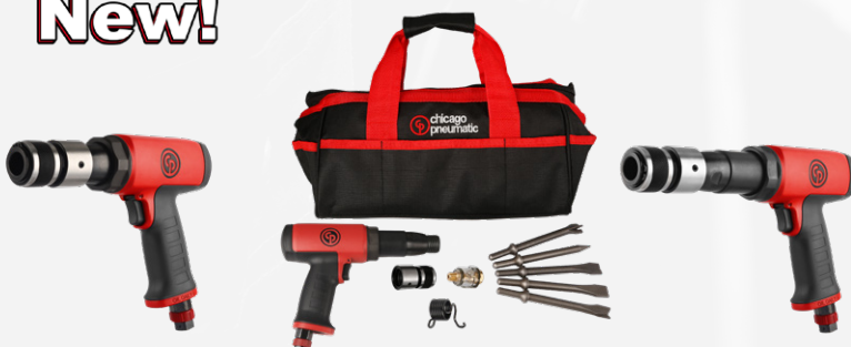
8 Joules CP7160K 8941071601 2,200,-