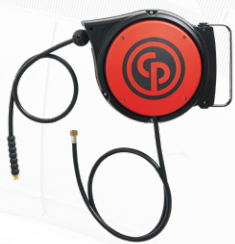
HR8108 & HR8208