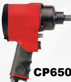
CP6500-RSR T025216 3,600,-

The best heavy-duty 1/2" for the toughest jobs!