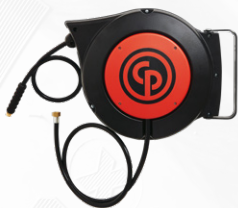
HR 8110 & HR 8210